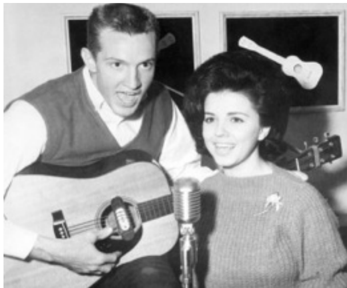
Paul and Paula

On most days our routine was – do the show, travel anywhere from 100 to 300 miles to the next date, get some sleep, and start all over again. I have fond memories of driving down the highway in the middle of the night when many times several of the singers on the show would entertain everyone with some beautiful harmonies. Brian Hyland of Sealed With A Kiss fame always had his flat top (Martin guitar) with him and sang to everyone a lot.